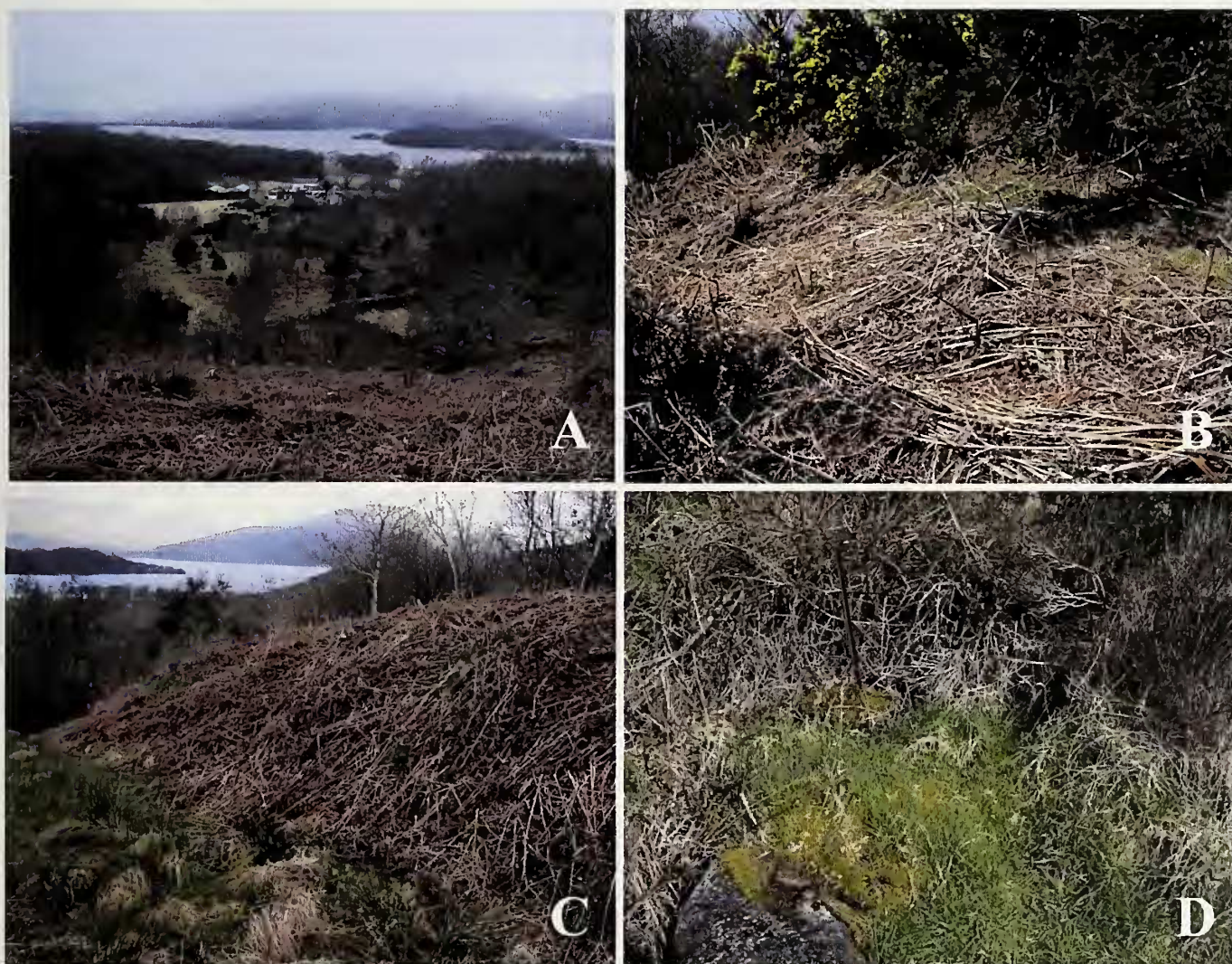
Fig. 4. (a) Adder Vipera berus habitat on a lowland replanted native woodland at study site B. (b) & (c) Typical adder hibernacula on south facing slopes with bracken and gorse. (d) A more cryptic hibernaculum on flat ground, but with dense vegetation.